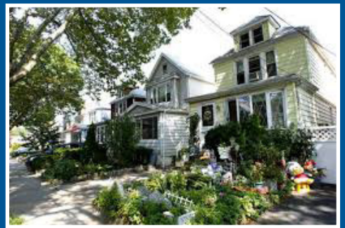
The housing crisis has made it tough for many to afford to stay and call this home. But there is a better choice.